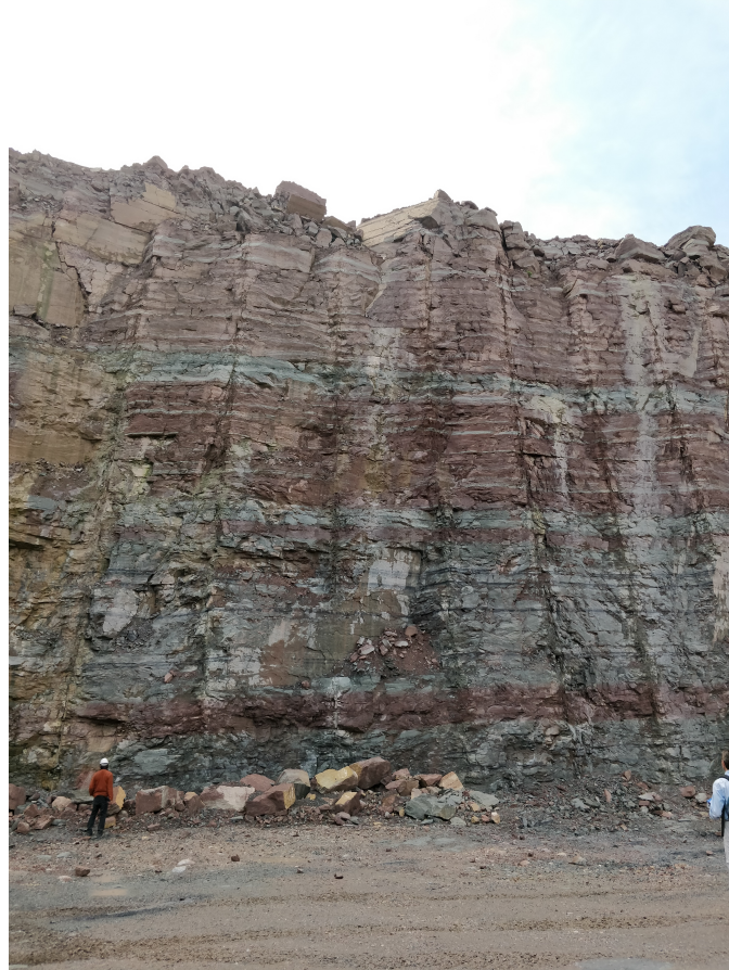
Cyclic deep-water Famennian deposits at the Effenberg Quarry in Germany.